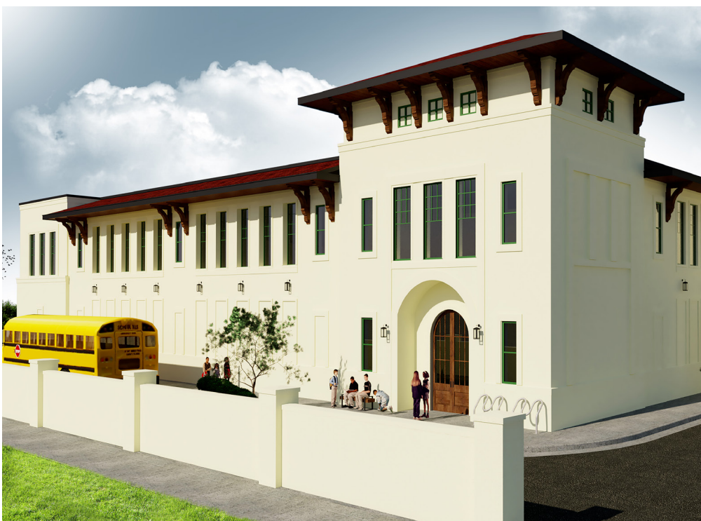
Architectural rendering of the Heritage Academy gymnasium.

Well, it's time to share with the family what has been happening at Heritage Academy.