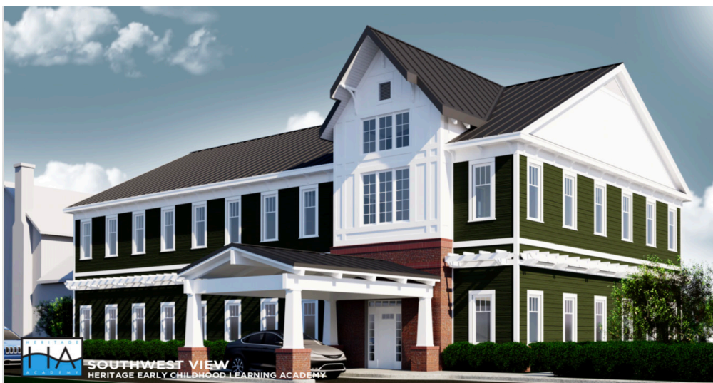
Architectural rendering of the Heritage Early Learning Academy.